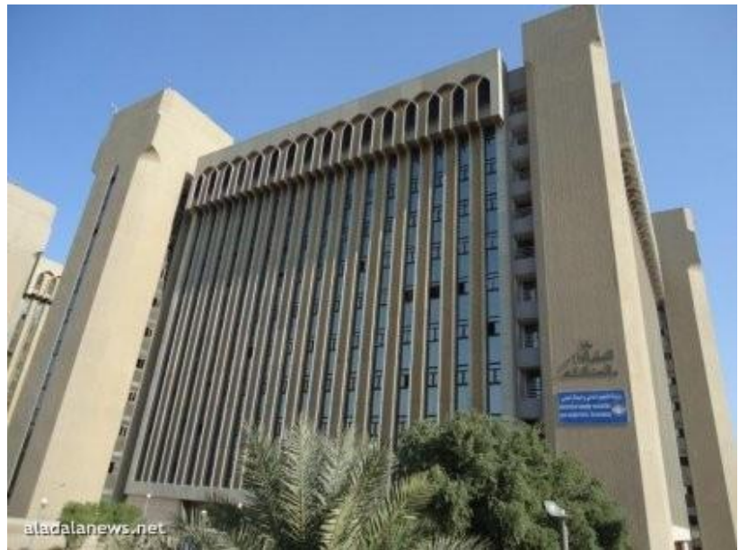
Reference: Ministry of Education, Baghdad Supply: A.H.U.s (Mekar) 3-way valve (Honeywell) Pipe fitting (Econesto)