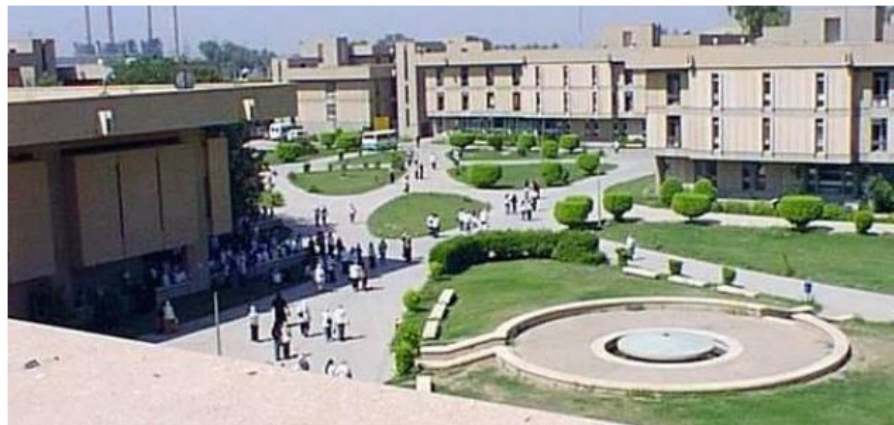
Reference: Razkari Hospital, Erbil Supply: MDS system (McQuay)