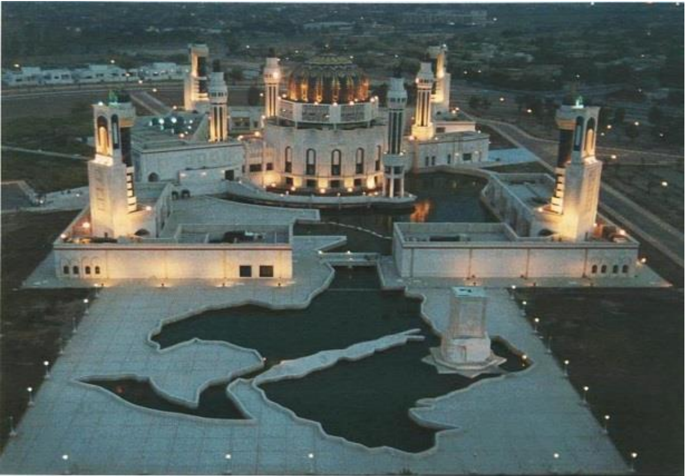
Reference: Um Al Kora Mosque, Baghdad Supply: Cooling towers (Decsa)