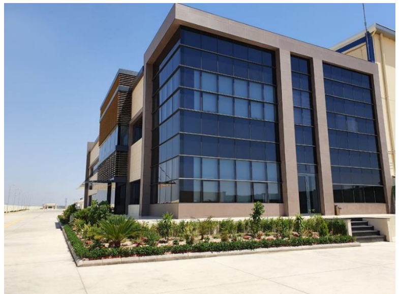
Reference: Almutahida company Supply: Cooling tower, Split units, Fresh air package units & Design chilled water pipe system