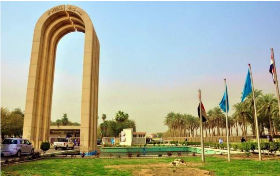
Reference: Baghdad University Supply: Air outlets and duct silencer (Kbe)