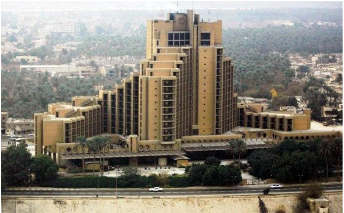
Reference: Babylon Hotel, Baghdad Supply: A.H.U.s (Mekar) Air outlets (Kbe)