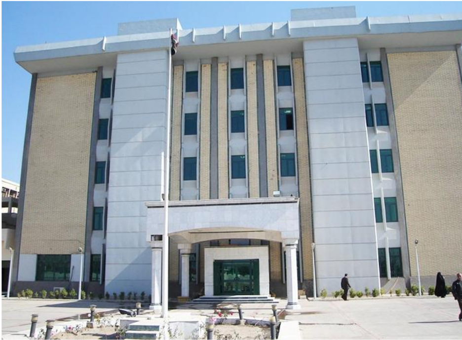
Reference: National Centre, Baghdad Supply: A.H.U.s (Mekar) Cooling Towers (Decsa)