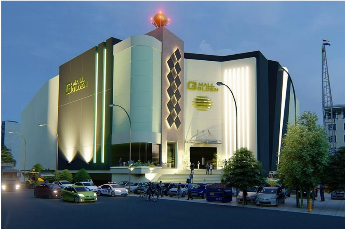
Reference: Golden mall Supply: VRF system