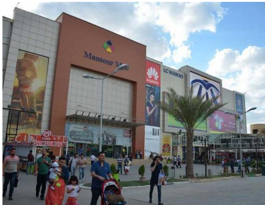
Reference: Mansour Mall, Baghdad Supply: Chillers (McQuay), A.H.U.s (McQuay), F.C.U .s (McQuay)